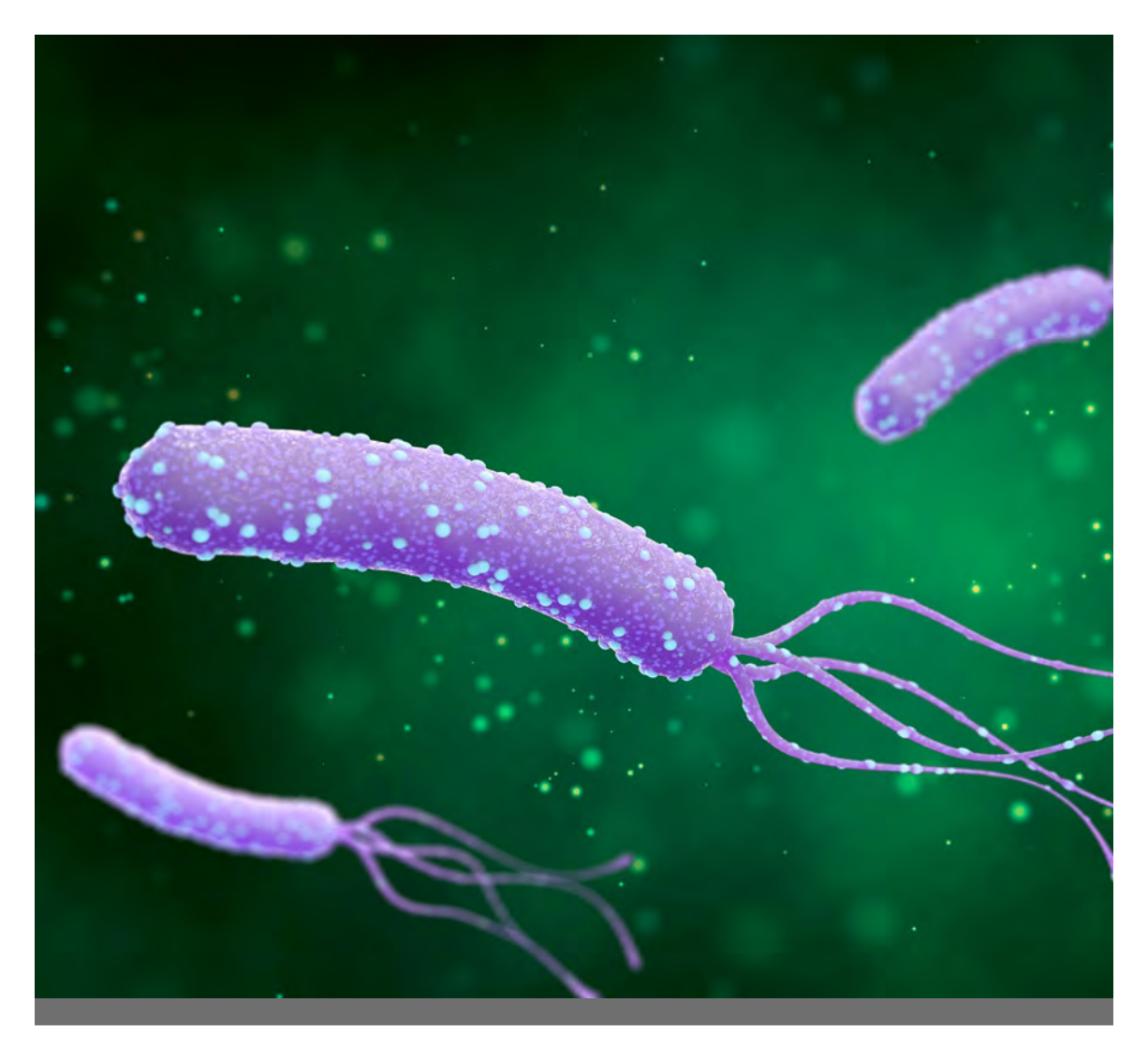
- Exclusive information for health-care professionals -